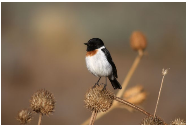
FIGURE 1 Adult male African stonechat

Here, we compare telomere length of two closely related sister taxa of stonechats, Saxicola torquatus axillaris (Figure 1) and Saxicola rubicola that breed in tropical and temperate environments, respectively (Doren et al., 2017; Urquhart, 2002). At all latitudes, stonechats are socially monogamous, open habitat, insectivorous passerines that aggressively defend breeding territories (Apfelbeck, Mortega, Flinks, Illera, & Helm, 2017). However, they vary in pace of life according to their environment (Ricklefs & Wikelski, 2002). Stonechats show a latitudinal cline in metabolic rate, with genetically inherited, higher metabolic rates in higher-latitude populations (Klaassen, 1995; Tieleman et al., 2009; Versteegh, Schwabl, Jaquier, & Tieleman, 2012; Wikelski, Spinney, Schelsky, Scheuerlein, & Gwinner, 2003). Further, temperate stonechats have a genetically fixed larger clutch size than tropical ones (Gwinner, König, & Haley, 1995), and their higher fecundity correlates with elevated baseline corticosterone concentrations during the breeding season (Apfelbeck, Helm, et al., 2017). In agreement with lower adult extrinsic mortality in tropical environments, local survival of tropical stonechats appears to be much higher than that of temperate